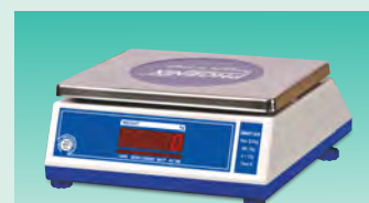
On Body Rear Display