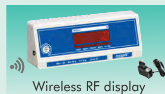
Wireless RF display