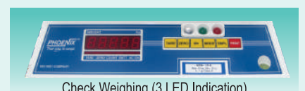
Check Weighing (3 LED Indication)