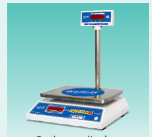
Rod type display