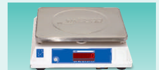
Rear side on machine display