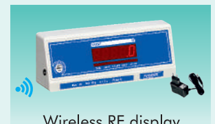
Wireless RF display