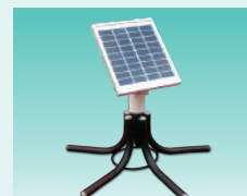
Solar Panel with Stand