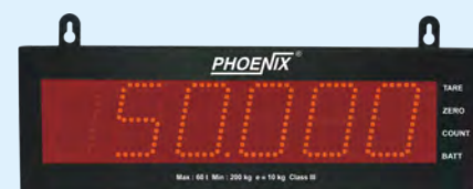
(500 mm L x 162 mm H x 33 mm W) Display Size : 81 mm (height)